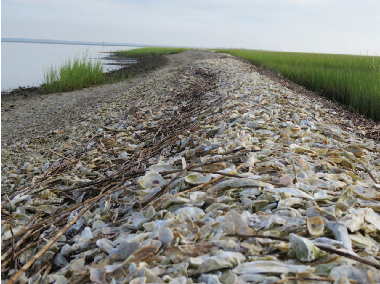
FIGURE 1. A typical shell rake along the Atlantic Intracoastal Waterway (AICW) in the Cape Romain region, South Carolina, USA. Shell rakes in this area tend to be long and narrow, bordered by water on one side and salt marsh on the other, and provide breeding habitat for American Oystercatchers.

the 1940s (Parkman 1983) and hence has been available as nesting habitat for oystercatchers for at least 70 years.