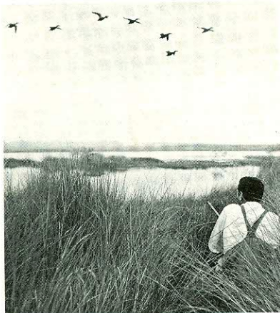
Louisiana's teal hunters bagged an estimated 96,000 teal during last year's nine day season. Some 33,000 special teal hunting permits were issued in the state and the bag by Louisiana hunters represented approximately 25 per cent of the total kill in the Mississippi and Central Flyways. The cover shows a teal hunter watching a flight of approaching ducks. The special season this year from September 22 through September 30 marks the third experimental September teal season. This represents wise management of a water-fowl resource that migrates through Louisiana before the regular duck season and returns to the United States after all duck hunting is over.

Published Bi-Monthly in the interest of conser- vation of Louisiana's nat- ural resources by the Wild Life and Fisheries Commission, Peabody Hall, Capitol Station, Baton Rouge, Louisiana 70804.